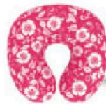
Sleeping Pillow LT-623

We have designed 2 items in different material, one is memory foam, the other is micro-beads pillow.