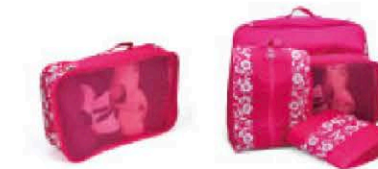
Travel Storage Kit LT-761

When folded, the size is equal to that of the phone. You can put it anywhere as you like. Moreover, the bag has big volume.