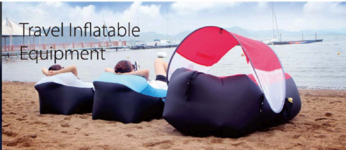
Travel Inflatable Equipment