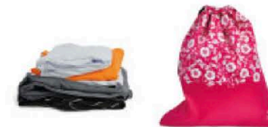
Laundry Bag LT-762

When folded, the size is equal to that of the phone. You can put it anywhere as you like. Moreover, the bag has big volume.