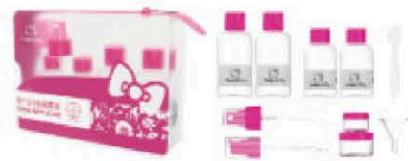
Toiletry Kit LT-672

This kit is compliant for toiletry carry-on-regulations from international standard flights. It is suitable for dispensing shampoo, shower gels, facial cleansers, lotions and so on, very compact, simple and elegant. *Please check page 31 for more details.