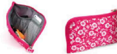
Electronic Storage Bag LT-781

We studied the travel habits of the young people, they don't have a suitable bag for the storage of their belongings. Thus we have designed a set of travel storage bags, especially for the clothes, shoes, chargers, etc. Besides, we did some fine treatment in the specifics of the bags, except the materials, all the zippers are designed to be the shape of the Hello Kitty bow-knot, which adds the element of Kitty.