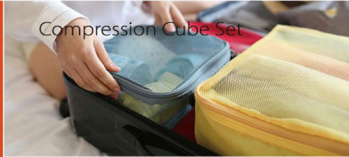
Compression Cube Set