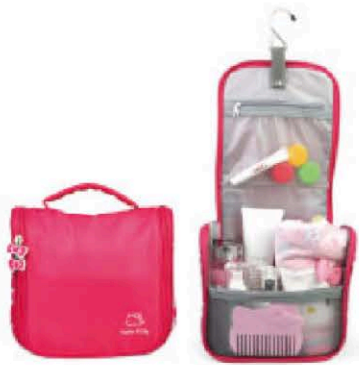
Hanging Toiletry Bag LT-692

The young people prefer to use their own toiletries, but their own bottles are always too big to be carried into the cabin. Also some people have many daily-used cosmetics but without suitable storage bags, that make the luggage in a mess. Thus we have designed a set of travel toiletries storage bags, you can pack the toiletries into small bottles, and then put all into a small storage bag.