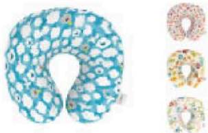
Memory Foam Pillow